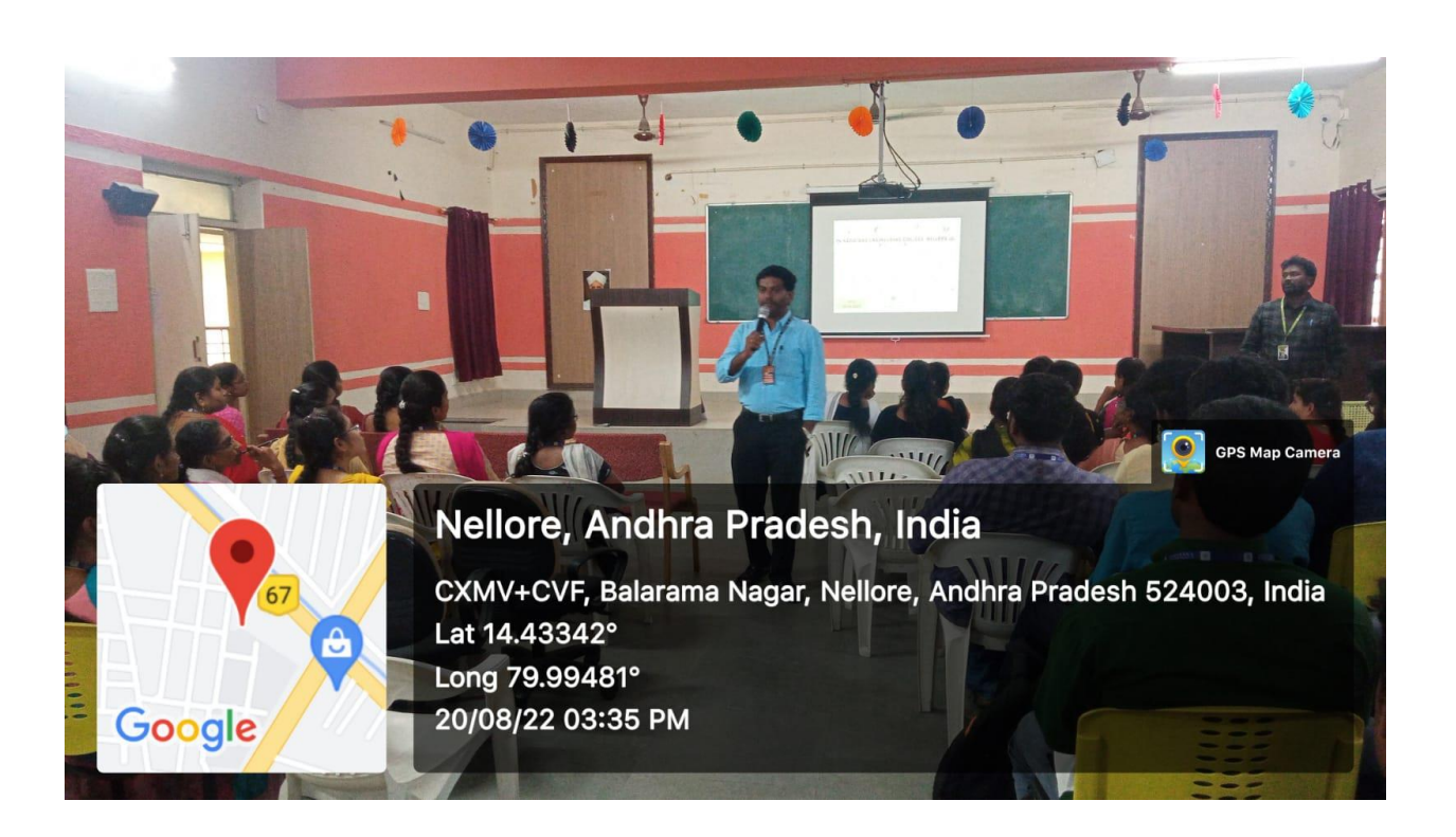
Resource person explaining about the different topics in Startups